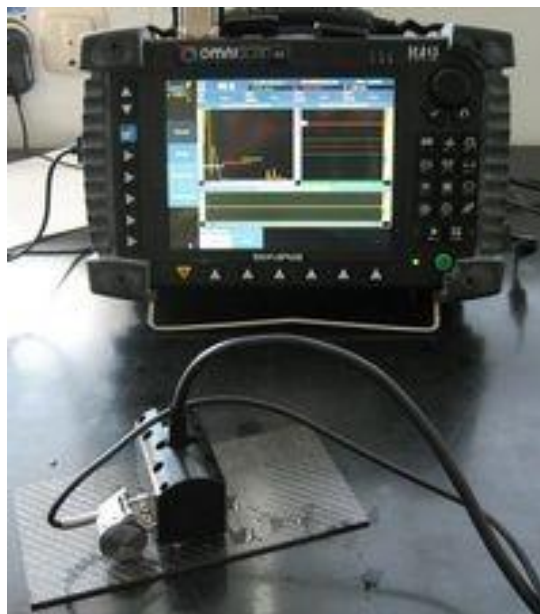
Figure 1: The portable Ultrasonic phased array system Omniscan MX from Olympus

The OmniScan MX2 (ultrasonic phased array) provides the ability to detect hidden corrosion, cracks and delaminations in multilayer structures. The 0-degree testing measures time-of-flight and amplitude of ultrasonic echoes reflecting from the part into gates in order to detect and measure defects.