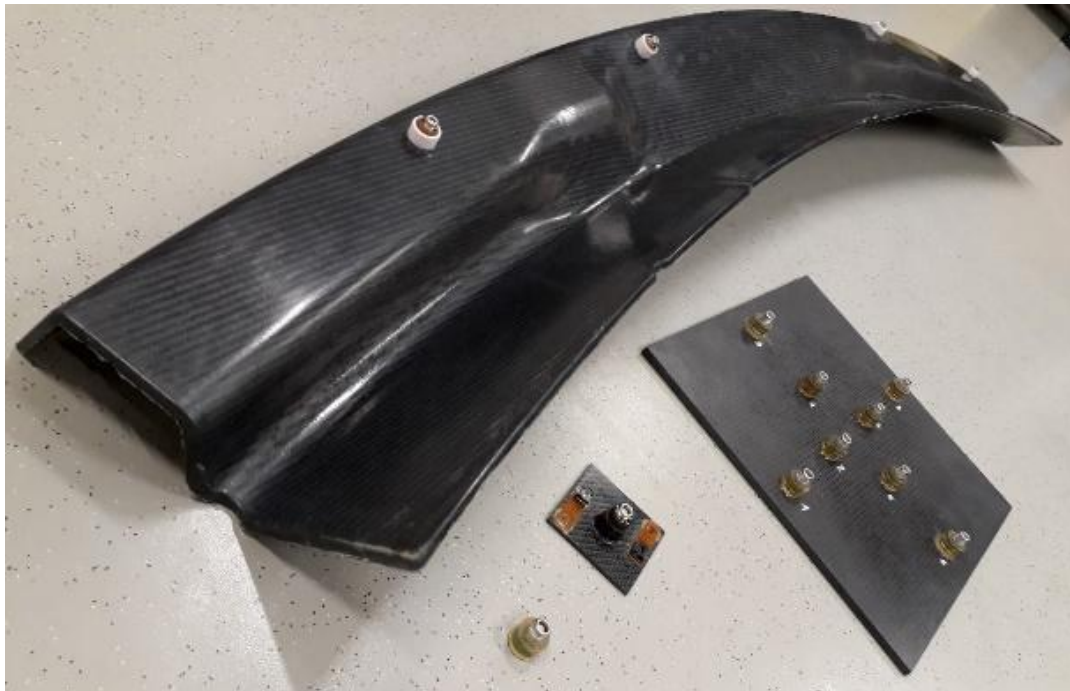
Figure 2: AAC Piezo Sensor and parts with integrated AAC Sensors for production and usage monitoring

The following data acquisition systems are available at AAC